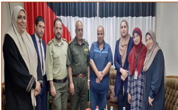
MUSAWA's team in Gaza meets the head of the Military Judiciary to investigate the avenues for empowering MUSAWA's oversight role to assure the conservation of the detainee's rights and human dignity.